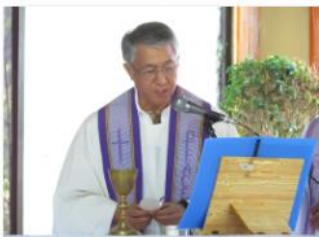
The Body of Christ