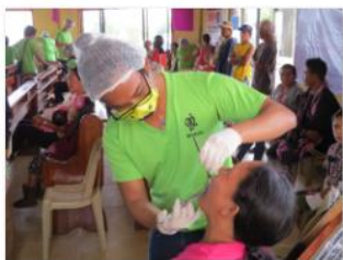
It's like the bite of an ant