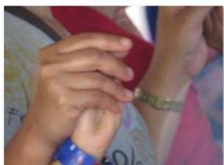
as it is in heaven