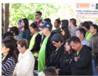
Our Father who art in heaven