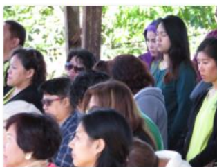
Lord, I am not worthy...