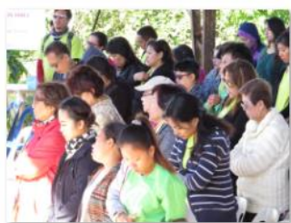
I believe in God