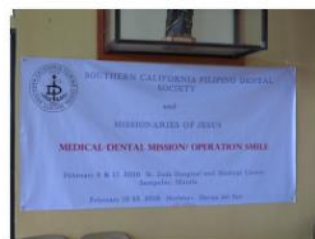
Southern California Filipino Dental Society