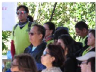
Lamb of God