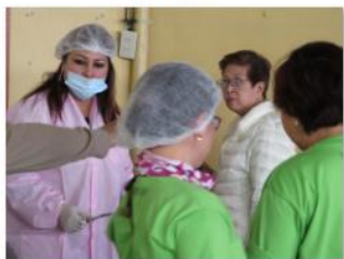
Send in the next patient