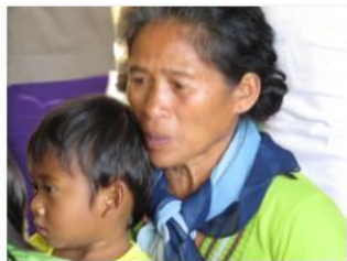
Jesus in disguise