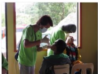
By the window