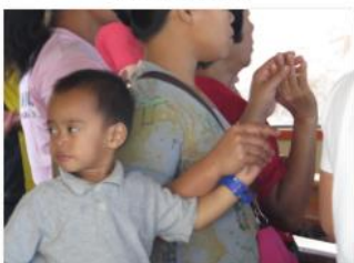
... on earth