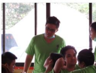
... more break