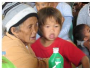
Faces of Jesus