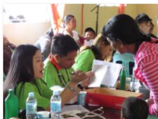
Go to the pharmacy