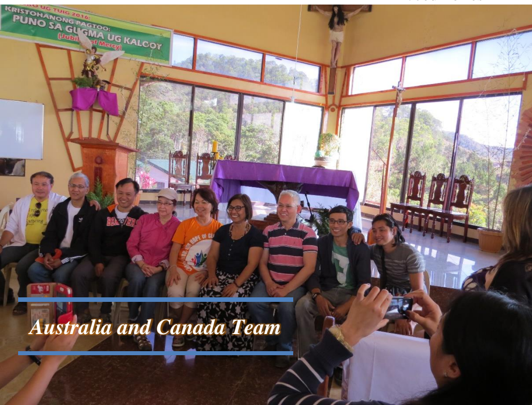
Australia and Canada Team