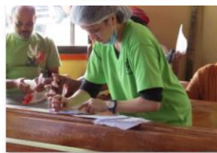
Three times a day