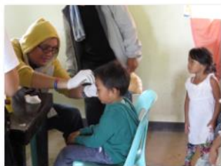
It will not hurt