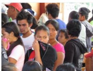
The long cue