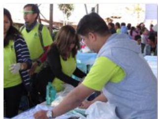
Here they are