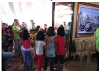
Who wants to sing