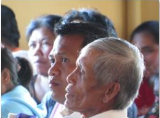
Parishioners of San Miguel Parish