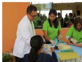
Consulting with the doctor