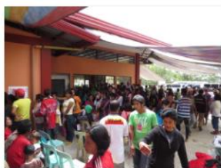
The long wait