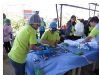
where are my instruments