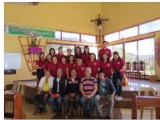
Baguio City Team

A total of 165 parishioners received dental services, 312 received medical services along with their required medications.