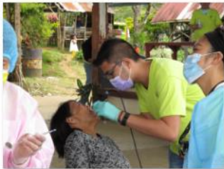
Work work work