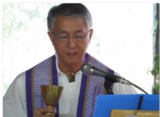
The Blood of Christ