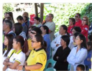
Holy, holy, holy