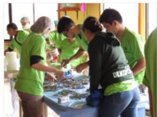
Preparing the Instruments