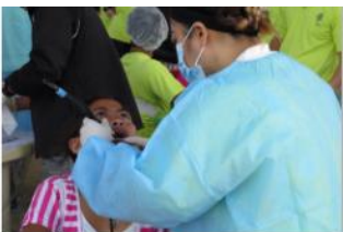
to save teeth