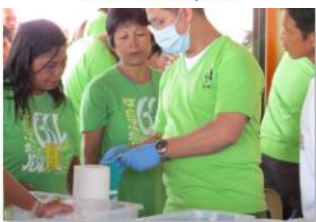
How to clean instruments