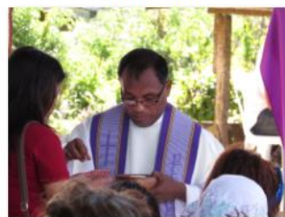
The Body of Christ. Amen.