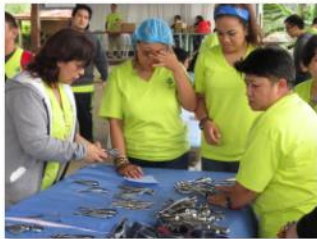
Hmmm, how do we do this