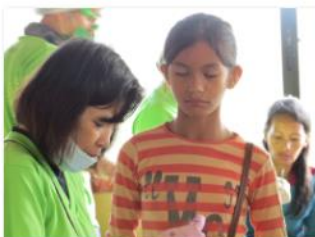
It's my first time