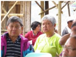
MJ Lay Associates