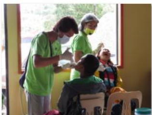
Okay ka lang